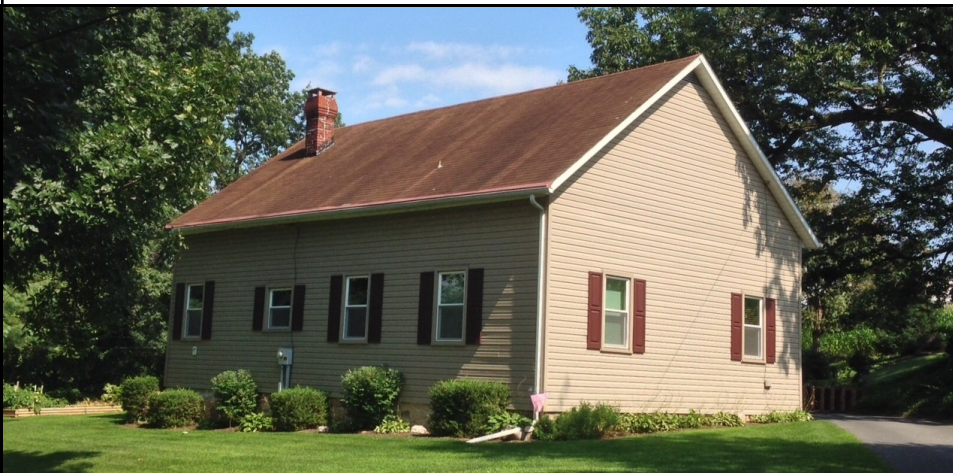
Above: The Webster schoolhouse bell, atop the foundation's carriage house. Left: The Webster schoolhouse, now a private home (2015).