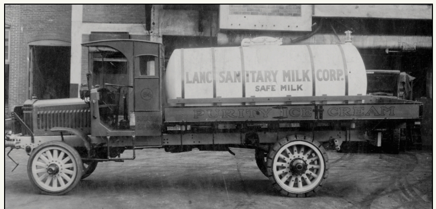
Early photo of Lancaster Sanitary Milk's truck. This business had origins in Lititz.