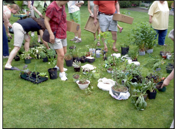
Photograph from our 2010 Plant Exchange

An announcement will be made at approximately 1:30 PM to select plants in exchange for your tickets. The Lititz Garden Club members will be on hand for assistance and to help answer gardening questions. You can bring 1, 2, 5, or more plants and enjoy the afternoon in the Foundation's Gardens! The event is open to the public and there is no charge for this event, but a free will donation can be made to help maintain the Gardens.