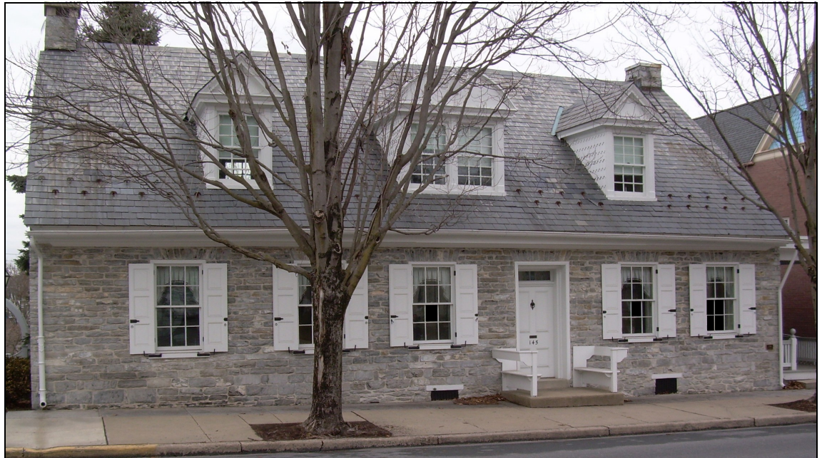
Above: The 1793 Christian Schropp house, home of the Lititz Museum.

The Lititz Historical Foundation's buildings on Main Street are filled with this history thanks to the people who had the foresight to preserve our past.