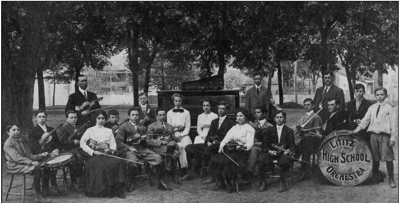
Speaking of music, we wanted to share with you this photo dated May 12th 1911. As the drum indicates on the right, pictured is the Lititz High School Orchestra.