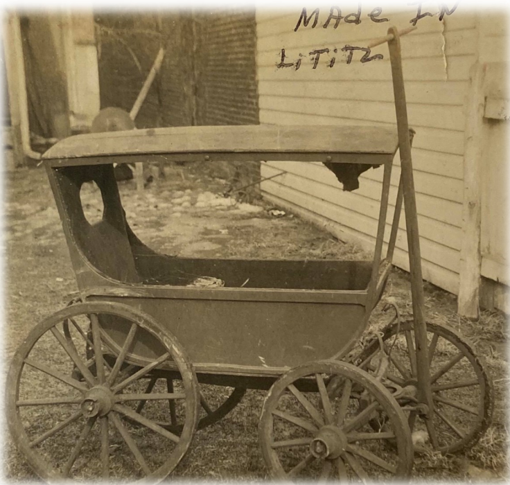
Top: The business when it was located at the corner of West Center Street and Pine Alley. Above: One of the many examples of their products.

The Grosh Carriage Works, at the corner of Broad and Orange Streets, was demolished to erect a new St. Paul Lutheran Church in 1911.