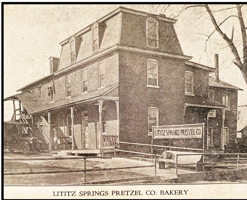
LITITZ SPRINGS PRETZEL CO. BAKERY